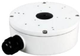
A22 JUNCTION BOX